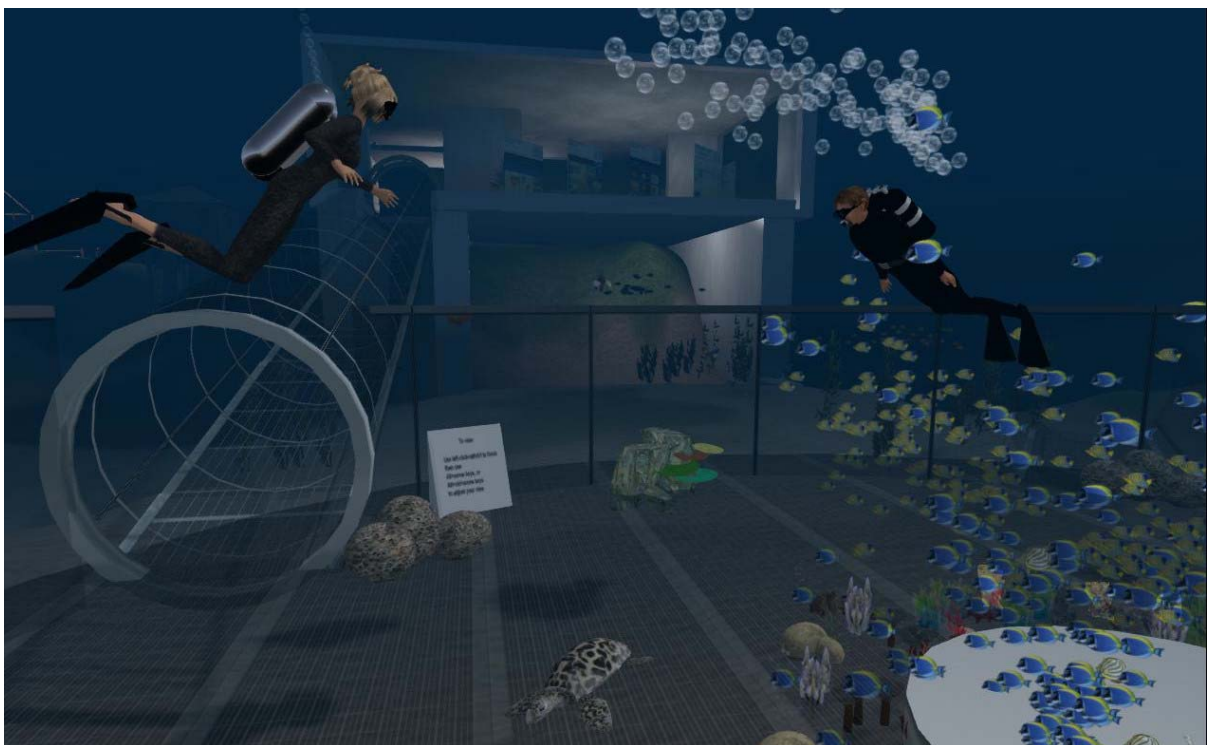
Figure 4: View within the Underwater Level