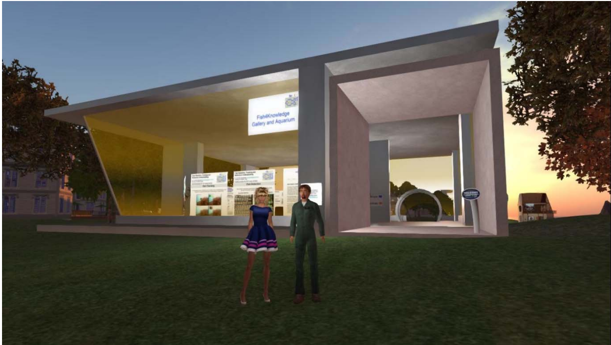
Figure 1: Front of the F4K Virtual World Gallery

The Fish4Knowledge virtual exhibition gallery is situated at a beauty spot by a lagoon at the heart of the Vue virtual world facilities. In this gallery, visitors are able to “walk” leisurely around our virtual building, via their avatars, to read about our project work and watch our underwater fish monitoring movies that were recorded at our observation sites. They are able to learn and be entertained in a beautiful surreal environment where the sunset is reflected by the nearby lagoon shining through the large floor-to-ceiling glass window walls. Alternatively, visitors can choose to visit our gallery on starry nights, or at any other times of the (virtual) day to enjoy the shimmering sea waves. Figure 1 shows the front of the F4K virtual gallery.