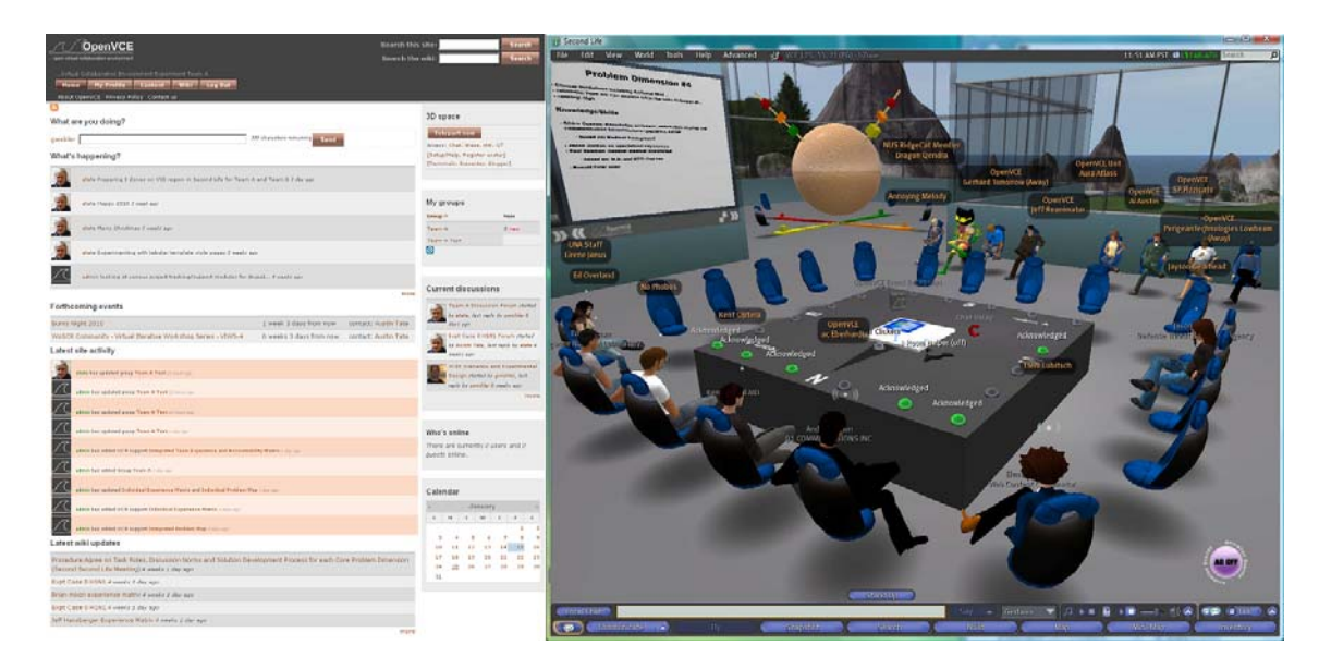
Figure 1. OpenVCE Website and 3D Virtual Meeting Space

The OpenVCE project [Hansberger, 2010; Wickler et al., 2013] aimed to develop an open virtual collaboration environment that facilitates collaborative work in a virtual space. The OpenVCE space consists of two linked environments: a dynamic website and a 3D virtual world space for meetings [Tate et al., 2009] as shown in figure 1. The left-hand side shows the Drupal- and MediaWiki-based website with recently added posts, and the right-hand side shows a virtual meeting in Second Life with a screen showing automatically generated information. This environment could, for example, be used to collaborate on the development of procedural knowledge, or it could be used during an actual emergency to manage information and courses of action. In fact, this environment contains a specific piece of software that supports these two functions: the <I-N-C-A> extension for MediaWiki.