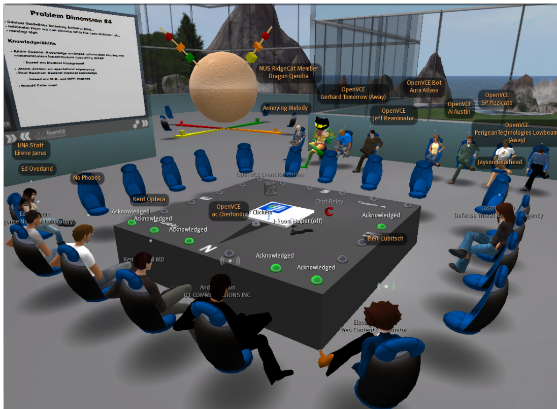
Figure 1. I-Room showing live information feeds and links to external data sources.

Beyond the advantages a shared interaction space confers, the I-Room can help deliver intelligent systems support for meetings and collaborative activities. In particular, we designed the I-Room to draw on I-X Technology, 1 which provides human participants with intelligent and intelligible task support, process management, collaborative tools, and planning aids. The I-Room can also utilize a range of manual and automated capabilities or agents in a coherent way. Participants share meaningful information about the processes or products they're working on through a common conceptual model called <I-N-C-A> (Issues-Nodes-Constraints-Annotations). 2 The I-Room framework is flexible enough to provide participants in I-Room meetings with access to knowledge-based content and natural-language-generation technology that tailors utterances to users' specific experience levels.