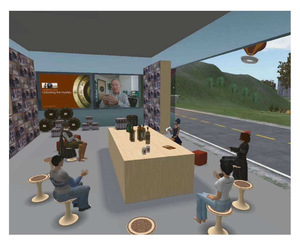
Figure 4. A virtual whisky-tasting I-Room. Participants enjoyed a tutored virtual whisky tasting in the Virtual World of Whisky I-Room.

factual information delivered in a mixed-initiative manner. The success of this event—and the enjoyment it provided—has helped convince those involved of the potential of intelligent virtual world spaces for engaging social users and potential customers.