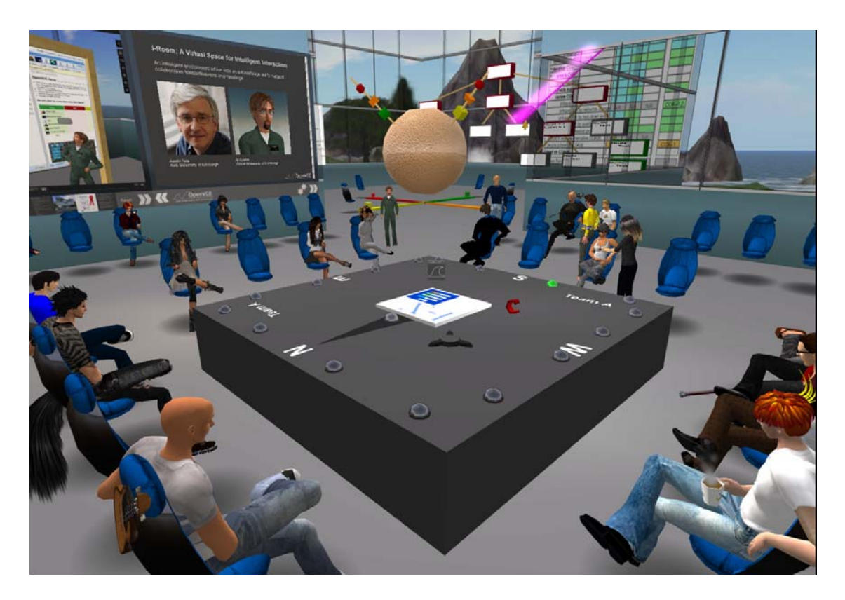
Figure 1. I-Room – a 3D virtual space for intelligent interaction.

With some justification, one could argue that this is not the most effective use of this technology and that it risks mistaking the inessential (and possibly, where collaboration is concerned, detrimental) physical aspects of these spaces in the real world for features that are somehow integral and necessary for collaboration. As a result, we risk replicating these accidental features in a virtual world. However, this must be weighed against the advantage of this approach, namely that the simulation of identifiable real-world spaces offers instant familiarity to users, most of whom have had little prior experience with virtual worlds. As the technology continues to improve and develop, and as our experience with developing and using I-Rooms expands, we expect to be able to hone these ideas into virtual spaces that are optimized for different types of collaboration. (See the "A Brief History of Virtual Collaboration" sidebar for previous work in this area.)