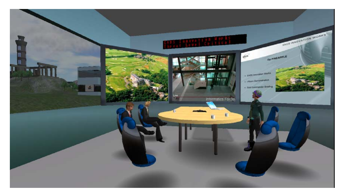
Figure 3. Inside the crisis response virtual operations center (VOC) I-Room. This instrumented meeting room (IMR) lets participants capture, tag, and timestamp audio, video, and other feeds to provide an audit trail for a post-incident review.

Colleagues in this scenario needed to interact in both real and virtual spaces. This, and the importance in such situations of providing an audit trail for post-incident review, led to the deployment of a customized VOC (see Figure 3) mirrored by a real-world briefing room that, in addition to standard communications facilities, was set up as an instrumented meeting room (IMR) that lets participants capture, tag, and timestamp audio, video, and other feeds (http://www.amiproject.org).