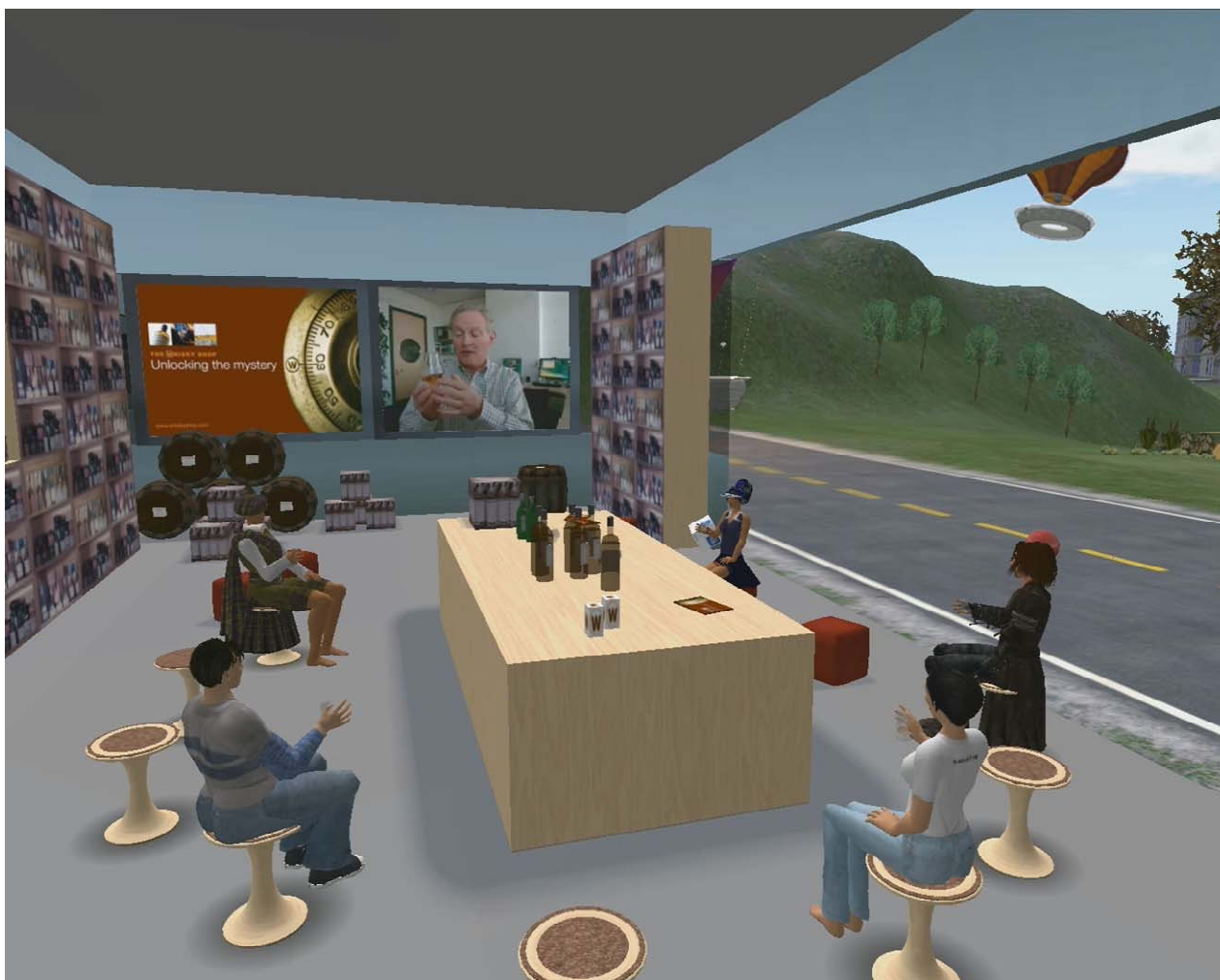
Figure 7: Virtual World of Whisky I-Room in Second Life

The tutored whisky tastings conducted in the VWoW I-Room mirror whisky-tasting events that The Whisky Shop regularly holds in real life. Videos of both events are available through the I-Room project website.