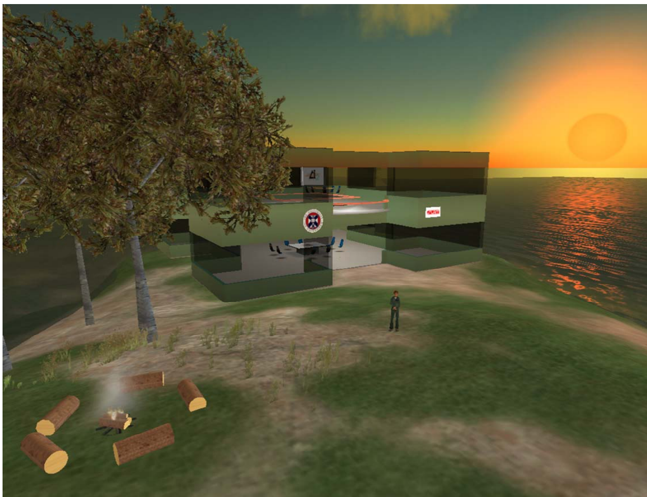
Figure 1: Example of I-Room Exterior

This paper describes a number of applications of I-X and I-Room technology: for product team meeting support, in an emergency response virtual operations centre, and for tutored whisky tastings in the “Virtual World of Whisky”.