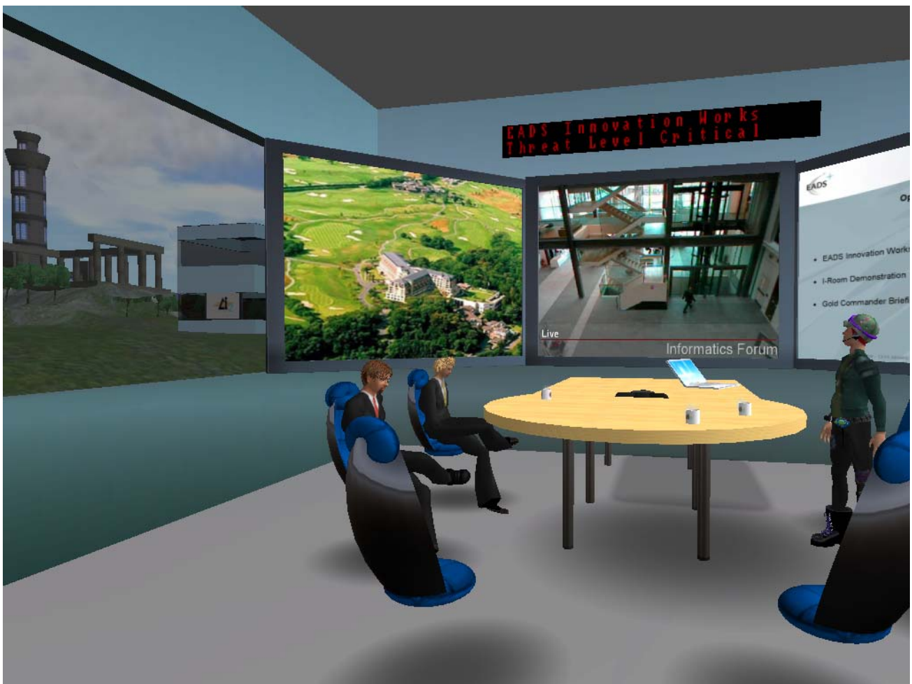
Figure 6: I-Room – Homeland Security Virtual Operations Centre

The scenario, as it was played out, required a response to a major security incident (a potential terrorist threat) during the event. The chief of security, located in the IMR briefing room, developed a plan of action with his immediate staff, and then uploaded this plan into the VOC I-Room. People playing the roles of senior officials from central government and the security services were invited to convene in the VOC, where they were briefed by the security chief and, after making recommendations and giving advice, a final plan was endorsed and recorded. The security chief then exited the VOC, and from the briefing room proceeded to put the plan into effect.