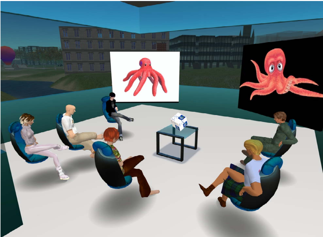
Figure 4: Slam Games I-Room Meeting with Character Designs