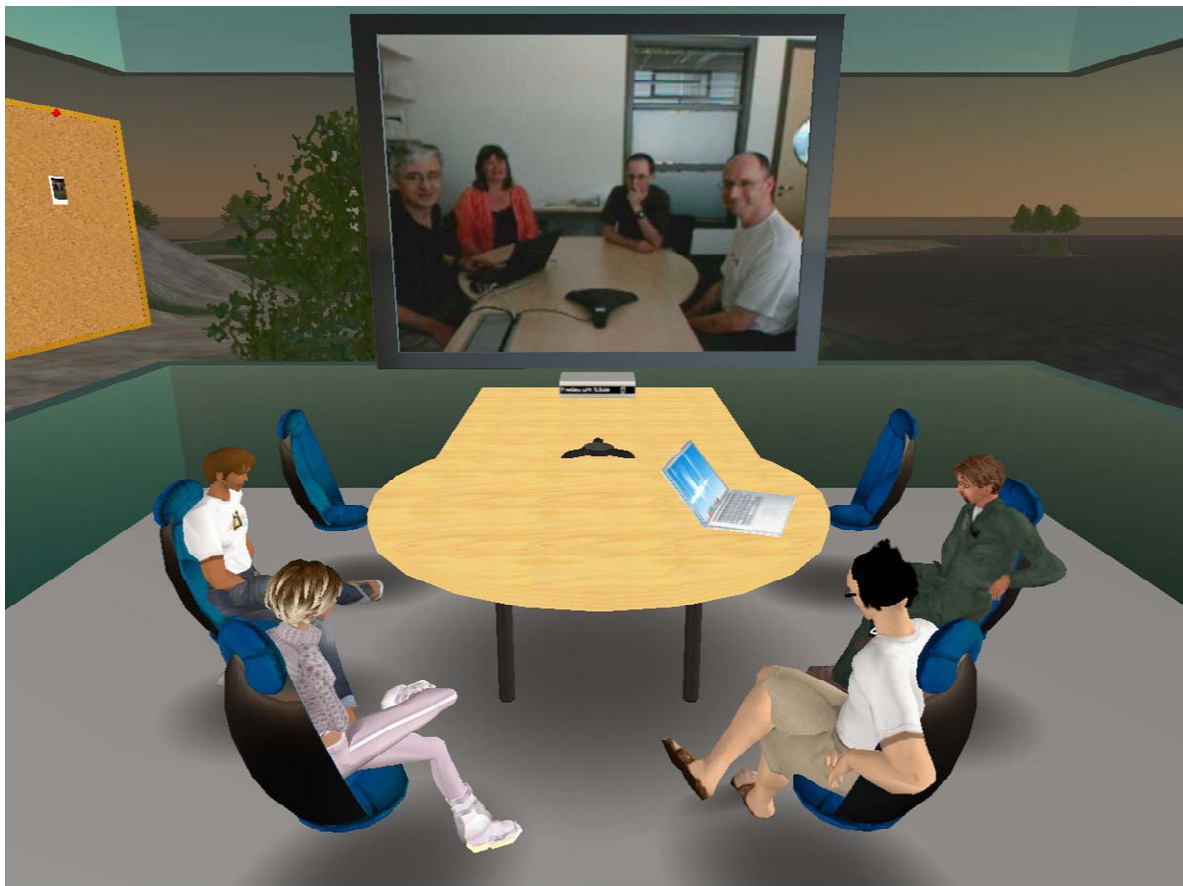
Figure 5: I-Room – Real Meeting Space linked to a Virtual Space

The Virtual Collaboration Centre provides a facility within which it is possible to set up and maintain a persistent set of information assets (e.g. wall posters, maps, etc.) and dynamically loaded content (such as imagery, movies, web page contents, etc.) in an area that is shared by the participants. They can access and modify these during synchronous meetings, and also at other times as the situation develops and users set about their individual tasks.