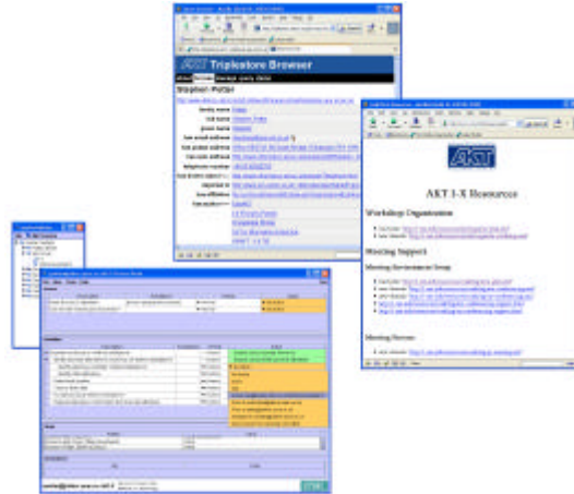
Workshop Organization Support