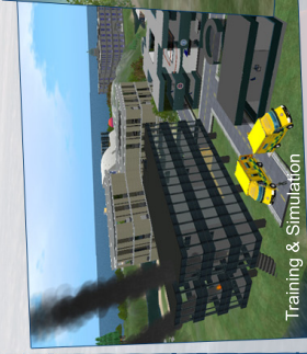
Training & Simulation