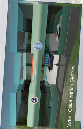
Virtual Collaboration Centres