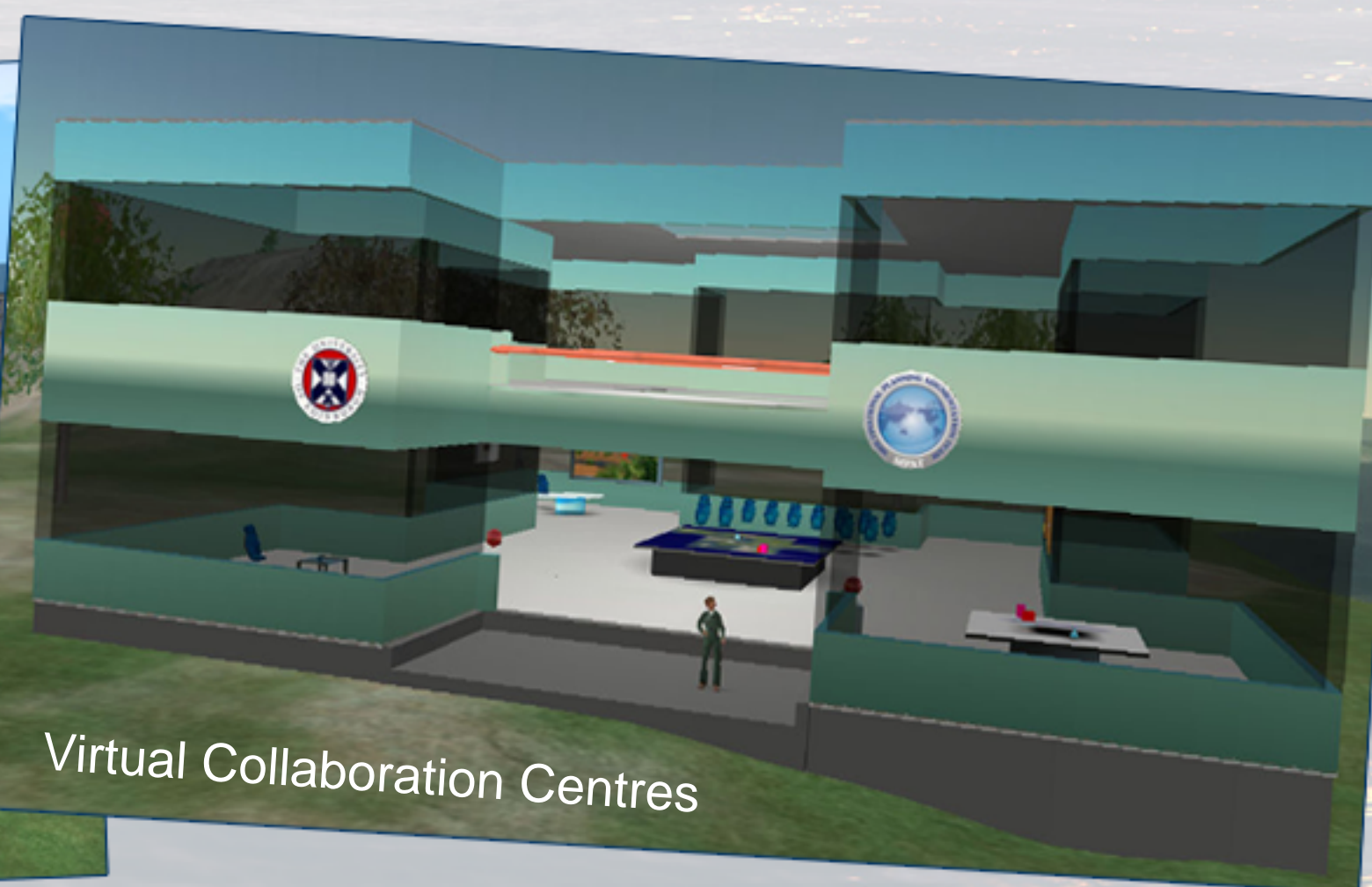
Virtual Collaboration Centres