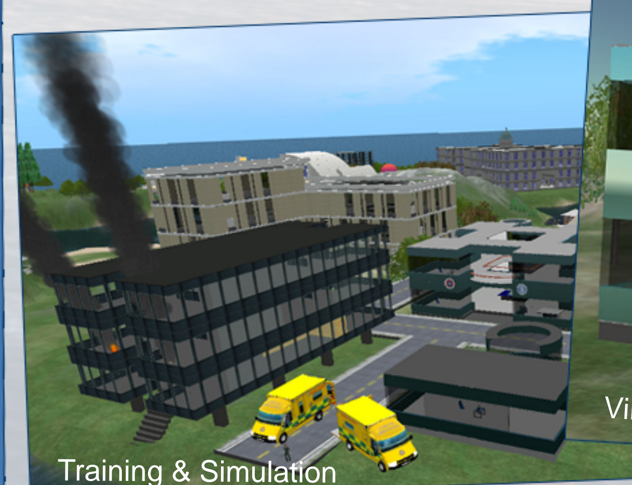
Training & Simulation