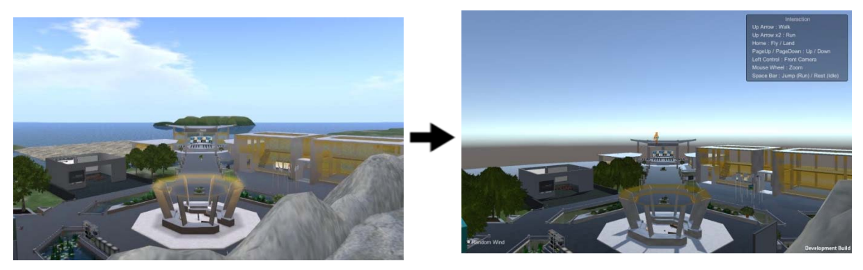
Figure 5: OpenVCE region in OpenSimulator and as Converted via OAR Converter to Unity

The OAR Conversion process does not bring across any active scripting, particle systems (for smoke, fire, etc.) or special light sources. Where important for the converted scene, these need to be added back into the resulting Unity project.