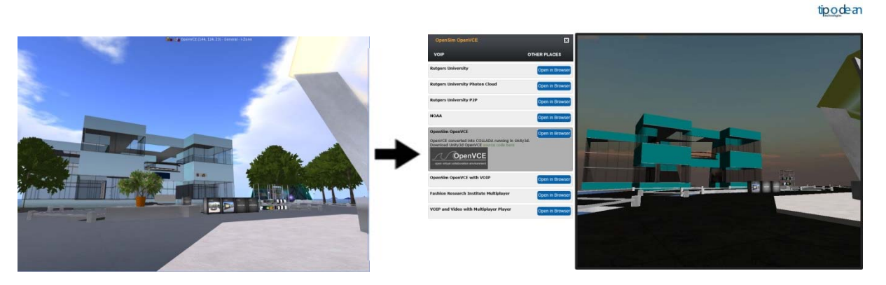
Figure 1: OpenVCE Region in OpenSimulator and via Tipodean Converter to Unity

Note that the Tipodean conversion service became unavailable in 2015 but examples are available at http://converter.tipodean.com/unity3d/