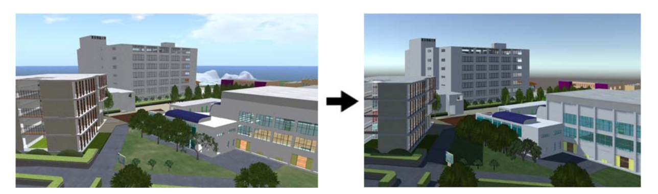
Figure 4: TUIS region in OpenSimulator and as Converted via OAR Converter to Unity

In this test case, only the shader for two materials (data for a fraction of tree leaves) was modified manually after data was loaded into Unity. In addition, problematic or erroneous conversion of object shapes did not occur as far as can be determined from visual inspection.