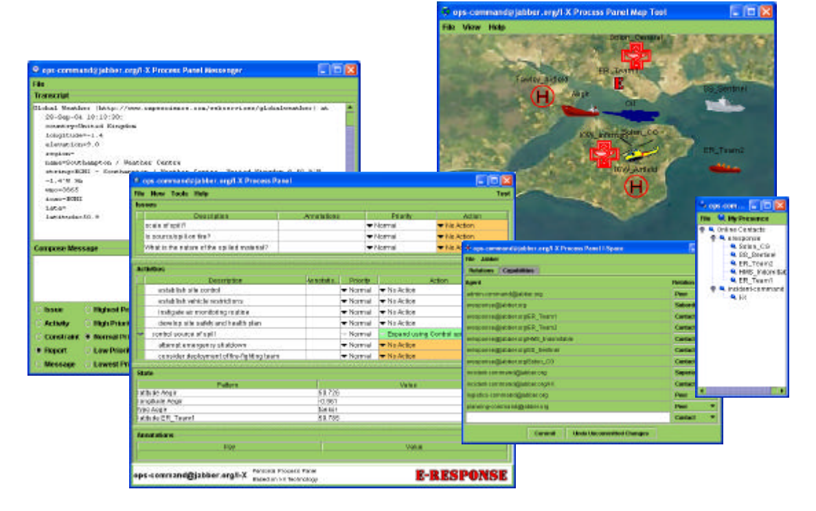
Figure 2. An I-X Process Panel, and its accompanying tools, shown here engaged in coordinating the response to a simulated environmental emergency.

In addition, to fully realise the C<sup>2</sup> aspect of FireGrid, it will be necessary to engineer knowledge-based support layers to, for instance, abstract the raw sensor data into meaningful concepts (e.g., "the central stairwell is on fire") and interpret simulation results ("the ceiling of the central stairwell will collapse in 10-15 minutes") so as to provide 'intelligence' for decision-making. Another key aspect will be the provision of suitable visualizations of this information, allowing for the most immediate communication of its content.